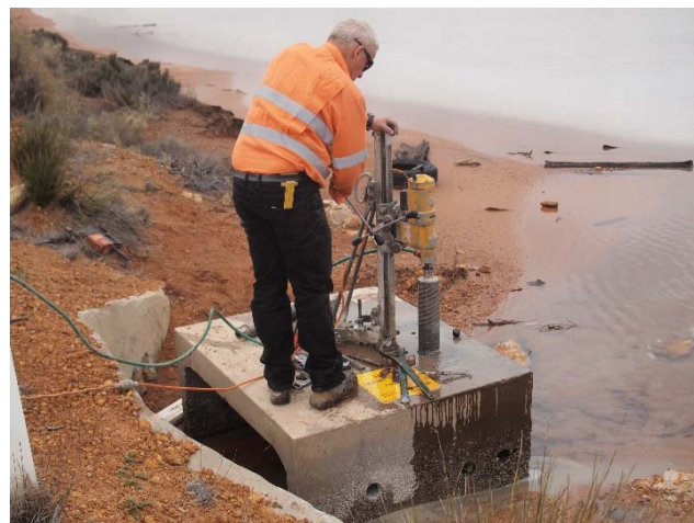
Figure 1: Field monitoring in Lake king WA

Geopolymer (GPC) concrete is prepared with sustainable cementitious materials and therefore, production of GPC can be reduced up to 80% of CO 2 emission from OPC concrete production. Although many investigations have been conducted on the mechanical and durability properties of GPC, the long term durability performance in field condition is a key concern related to application in civil infrastructures.