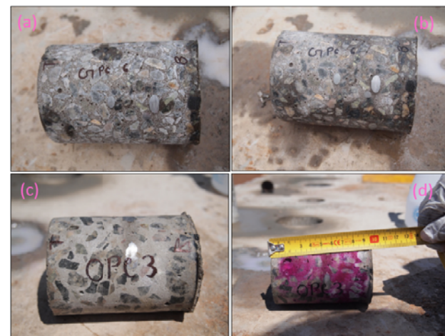
Figure 2: Carbonation depth measurement

Figure 3 depicts the variation of total chloride measurements with the depth of the concrete.